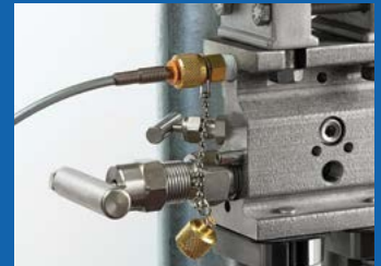
High Pressure Hoses & Quick-test Connections