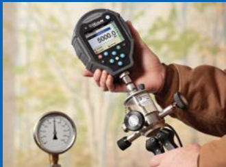
Gauges & Calibration References

Ralston Instruments provides complete pressure calibration solutions for a wide range of applications, saving time and taking the guesswork out of critical pressure testing, maintenance and repair operations.