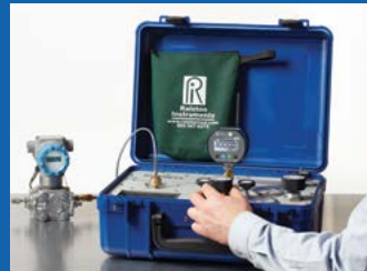
Compressed Gas Pressure Controllers