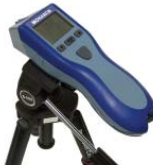
Pocket Tach 99 or Pocket Laser Tach 200 can be tripod mounted. Tripod not included.