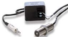
Remote Magnetic Sensor (MT-190-P) Gap 0.25 inches