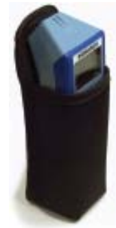
Pocket Tach 99 pictured with optional padded carrying pouch