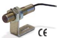
Remote Optical Sensor (ROS-P) Gap 36 inches

Optional plug-in Remote Sensors with 8 foot cables (100 feet optional)