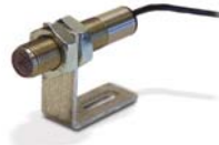
Remote Infrared Sensor (IRS-P) Gap 0.50 inches

Optional Remote Contact Assembly (RCA) with 6 foot cable.