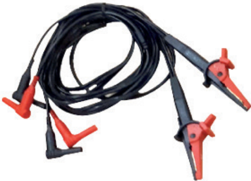
6 ft CAT IV 300 V rated compact kelvin clips, 4 mm shrouded plugs