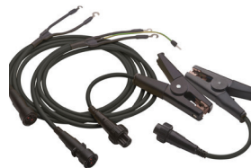
+ KC1 Kelvin clip 3 m leads