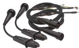
+ DH4-C probe 1.5 m leads