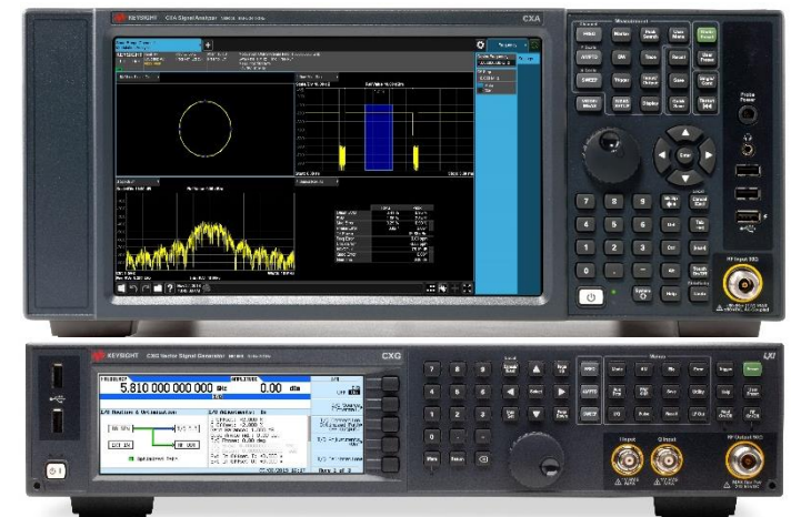
N5166B CXG RF Vector Signal Generator, 9 kHz – 3/6 GHz

N9000B CXA Signal Analyzer, 9 kHz – 3/7.5/13.6/26.5 GHz