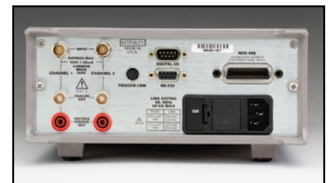
Model 2502 rear panel

The Model 2502 offers low current measurement ranges from 2nA to 20mA in decade steps. This provides for all photodetector current measurement ranges for testing laser diodes and LEDs in applications such as LIV testing, LED total radiance measurements, measurements of cross-talk and insertion loss on optical switches,