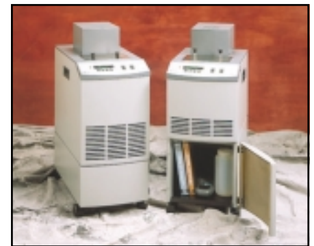
With an optional floor cart (including locking casters), your bath can easily be moved to any place you need it. (Available for the 6330, 7320, or 7340. Casters included on the 7380.)

Hart Scientific doesn't make chillers, circulators, or so-called utility baths, and utility bath manufacturers don't make metrology baths. Use the right tools for your work and reap the best possible results. Baths from Hart Scientific are the most stable and uniform of any you'll find. They'll give you results no other bath can.