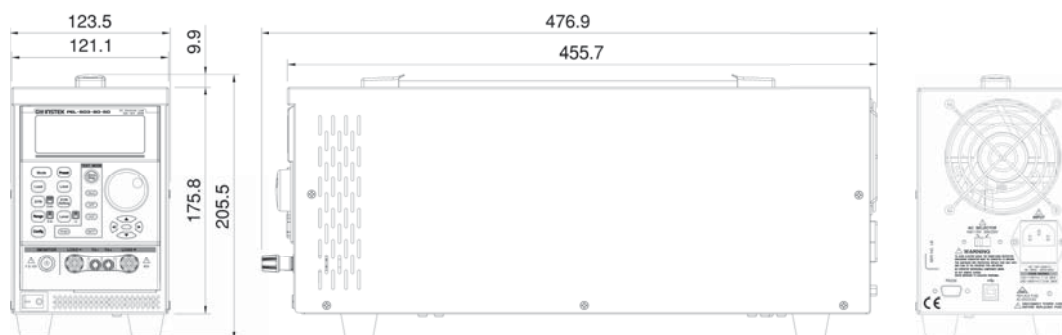
PEL-503-80-50 / PEL-504-80-70 / PEL-504-500-15