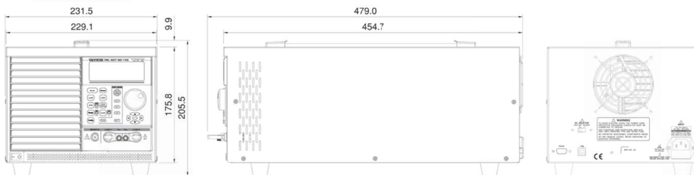
PEL-507-80-140 / PEL-507-500-30