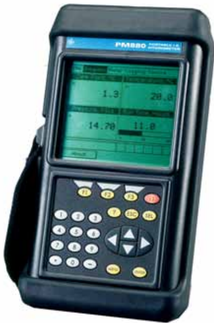
The PM880's large LCD displays moisture readings in dew point (°C or °F), ppm v , ppm w , lb/MMSCF (natural gas), and a variety of other unit options in graphic or alphanumeric formats.

Training for the PM880 is available on-site, in the factory or on line. GE offers extended warranties and service agreements for the PM880 as well as a range of services including NIST-traceable calibration, field calibration, rentals and moisture surveys.