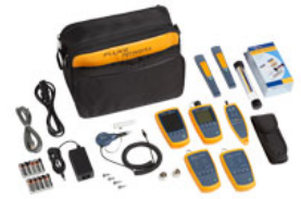
Both multimode and singlemode sources are available in the FTK1475 Complete Verification Kit