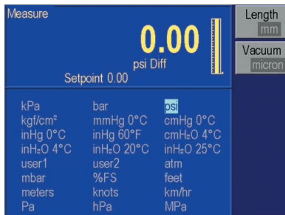
The large color display allows the pressure value to be displayed even when viewing a submenu selection such as the units selection screen shown above.

The Series 7250 Pressure Controller/Calibrator can easily automate your test and calibration workload. All are easy to use, easy to maintain, and have the reliability, performance and features that you want. The Series 7250 features an easy-to-navigate menu structure with full text descriptions for menus and commands.