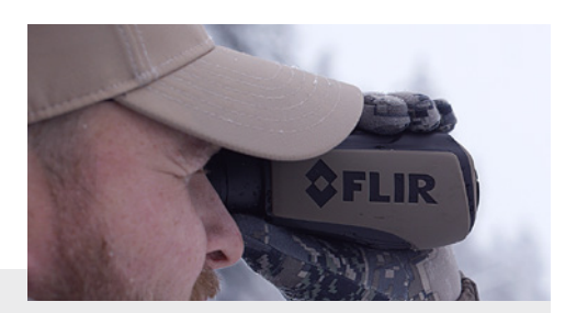
COMPACT AND RUGGED Fits in any pocket, weather and impact-resistant