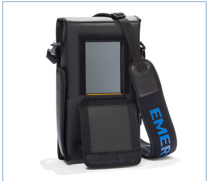
The useful carrying case protects your Trex unit in the field and provides storage options for accessory items.

Using the ValveLink Mobile app on the Trex unit, you can perform valve diagnostics in the field, including valve signature, dynamic error band, PD one button sweep, and step response, without having to pull the valve or perform invasive troubleshooting steps. ValveLink Mobile works with HART and FOUNDATION Fieldbus Fisher® FIELDVUE™ digital valve controllers and provides an intuitive user interface that is easy to understand and use. The large touchscreen on the Trex communicator makes it easier than ever to see all valve diagnostic details.