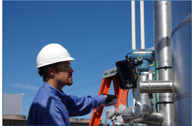
The magnetic hanger accessory allows you to attach the Trex unit to a pipe, freeing up your hands for other work.

You can also verify whether the DC voltage is correct in HART loops.