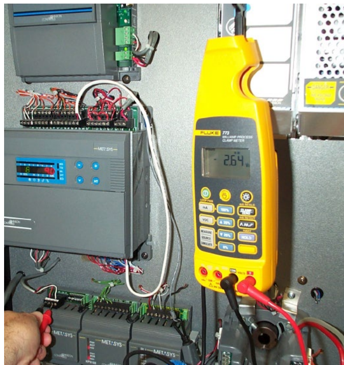
You can check the controller power supply voltage with a Fluke 773 Milliamp Process Clamp Meter. Power problems can affect the power supply and cause the controller to malfunction or fail.

When a power loss occurs, the backup generator will start after a short time delay. I happen to work in hospitals a lot, and by code the backup generators have to start within 10 seconds after utility power loss. Also by code the backup generators are tested