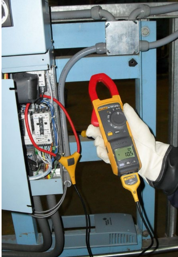
An iFlex™ flexible current probe is wrapped around the motor leads at a variable speed drive so the current can be measured with the Fluke 381 Clamp Meter. This shows whether or not a variable speed drive has been damaged by a lightning strike.

Recently I received a call that the fireman’s panel in a building was not functioning. This building has suffered from many power problems in the recent past, usually one every two weeks or so. The electronic controller in the panel had faulted out and had to be replaced. Obviously this was a critical system. The electronic controller was replaced and started up. It worked for a few seconds and then rebooted every 10 seconds.