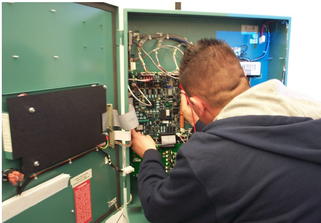
A technician checks the voltages at a centrifugal chiller electronic control panel. Tens of thousands of dollars in damage can occur due to incoming power problems.

If left uncorrected, these power problems will cause electronic devices to fail, which will in turn cause critical building systems to operate improperly.