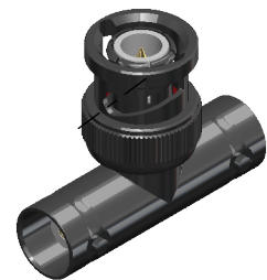
ISOMETRIC VIEW FULL SCALE