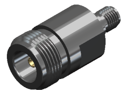
ISOMETRIC VIEW FULL SCALE