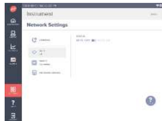
1. Configure network

Available in 1 ft 3 /min, 50 L/min and 100 L/min versions. The MET ONE 3400+ can sample 1m 3 in as little as 10 minutes