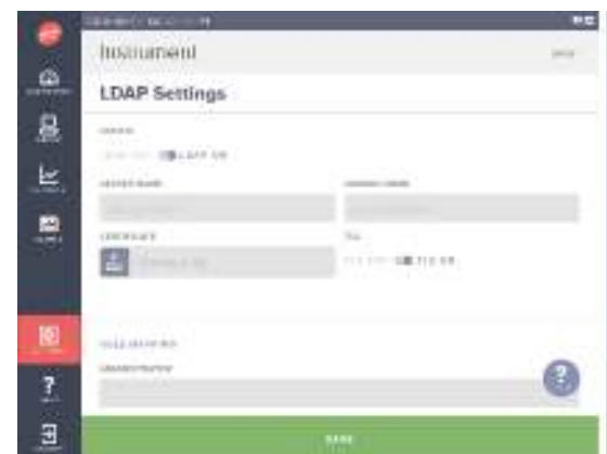
2. Choose LDAP settings including Active Directory