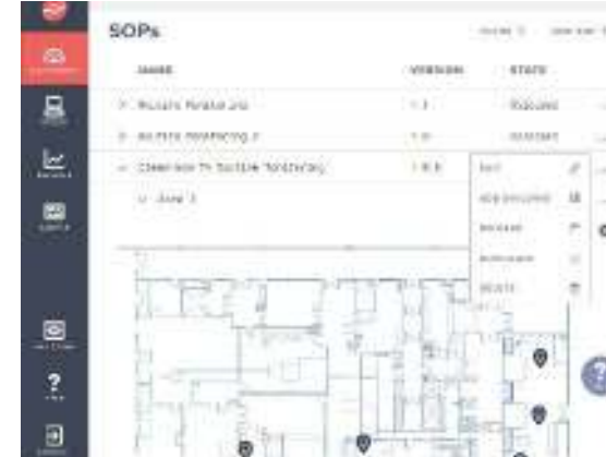
3. SOP version control inside the counter