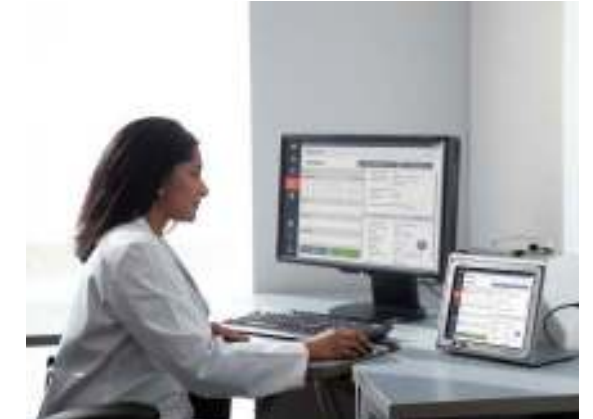
5. Review and approve monitoring results via web-browser