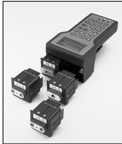
Model ATE-100 with AQS "Quick Select" Modules

SM-1 Voltage Adapter – allows ATE-100 to be used to check "live" pressure switches