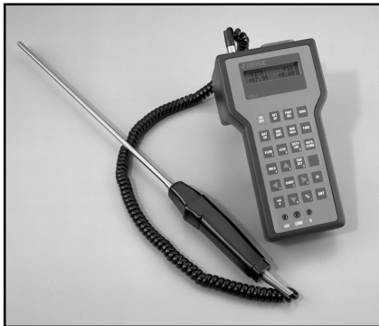
Model ATE-100 with AQS-RT1 and RTD Probe installed

Programmed to provide direct temperature readout from types J, K, T, E, R, S, B & N thermocouples or direct millivolt readout from any thermocouple.