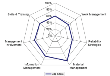
Discovery Visit Report