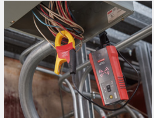
Intuitive transmitter automatically senses whether the system is energized or de-energized