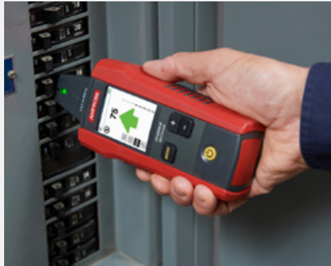
Reduce downtime with immediate and unambiguous breaker identification