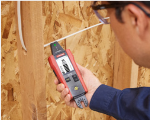
Most accurate wire tracing in its class with eight sensitivity modes