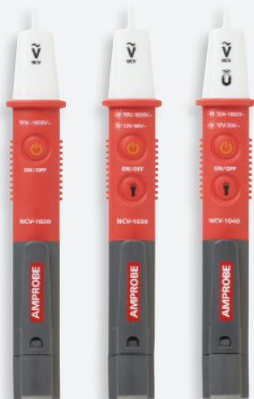
NCV-1000 Series Non-Contact Voltage Probe

The Amprobe NCV-1000 Non-Contact Voltage (NCV) tester series provides maximum safety and convenience for detecting AC voltage without interrupting electrical systems. Designed to conveniently fit in your shirt pocket, the NCV-1000 series performs in indoor and outdoor settings. Safety tested to the highest category measurement, CAT IV 1000 V, as well as IP65 water and dust resistant, the NCV-1000 series is fit for the toughest industrial applications.