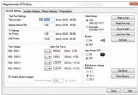
Four tabbed dialog boxes allow for clear and easy setup of all functions of the Model 5070, including setup for variable voltage and alarm set points, as well as step voltage tests and temperature compensation.