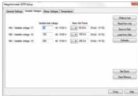
Variable Voltage selections from 40 to 5100V and can also be programmed along with alarm set points.