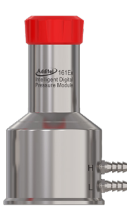
ADT161Ex pressure modules - See ADT161 Datasheet for more info