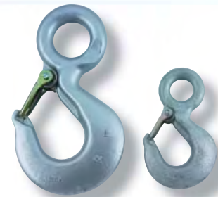
Eye Hook - EH