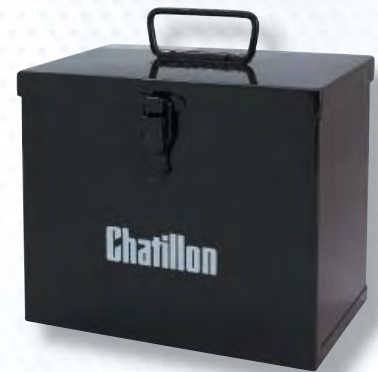
Optional Carrying Case

Notes: Dynamometers with "EH" come standard with Eye Hook. Dynamometer with "SH" come standard with Swivel Hook. Carrying Case must be ordered separately.