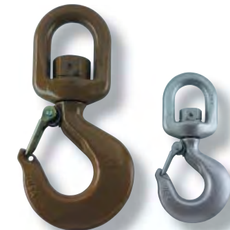
Swivel Hook - SH