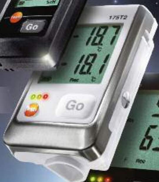
Logger series testo 176