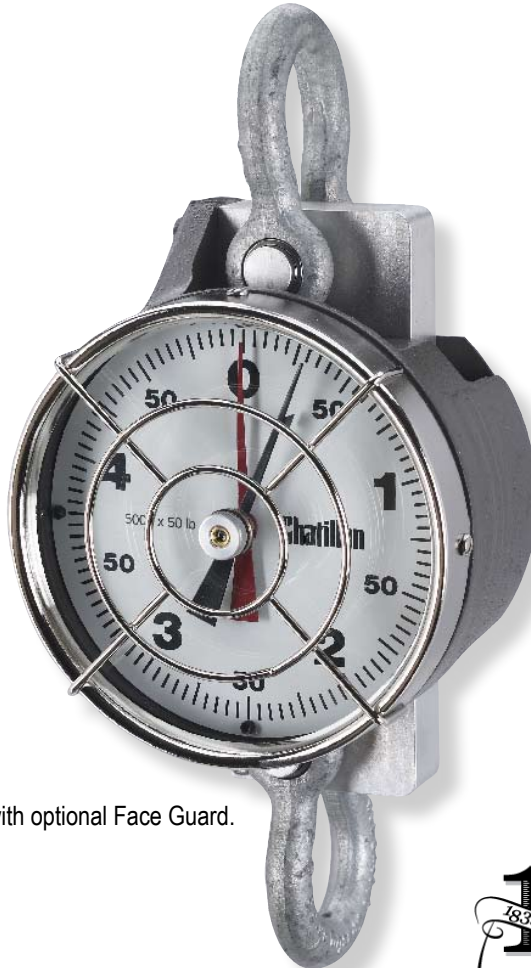
Shown with optional Face Guard.