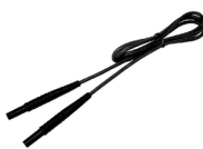
test lead with banana plugs; 1 kV; 4 ft (1.2 m); black