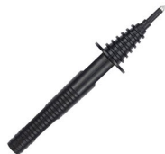
test probe with banana socket; 1 kV; black