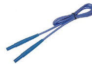
test lead with banana plugs; 1 kV; 4 ft (1.2 m); blue