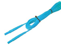
test lead 16.4 ft (5 m), blue, 1 kV (banana plugs)