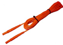
test lead 16.4 ft (5 m), red, 1 kV (banana plugs)