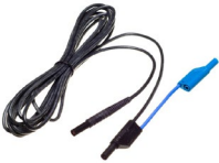
test lead 16.4 ft (5 m), black, 1 kV (banana plugs, shielded)