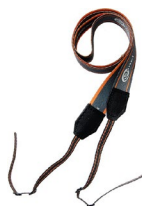
meter strap (type M-1)