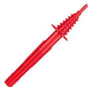
test probe with banana socket; 1 kV; red