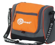
M-6 carrying case