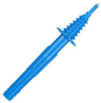
pin probe, blue 1 kV (banana socket)