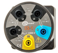
CS-1 cable simulator