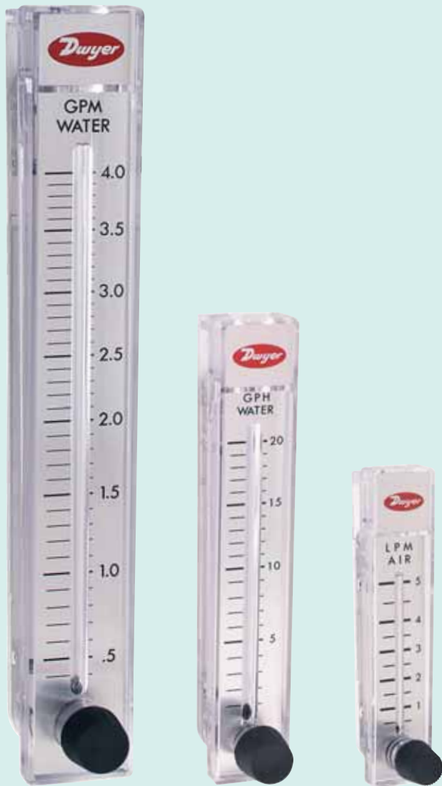
Model RMC-SSV 10" scale, 15-3/8" high