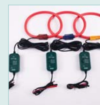
Model PQ34-30 3000A (24"/600mm) Flexible Current Clamp Probes for wrapping around busbars