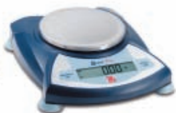
Scout Pro with Round Platform (4.7 in / 12 cm diameter)

600g x 0.1g 2000g x 0.1g 4000g x 0.1g 6000g x 0.1g 6000g x 1g