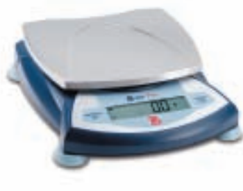
Scout Pro with Square Platform (6.5 x 5.5 in / 16.5 x 14.2 cm)

600g x 0.1g 2000g x 0.1g 4000g x 0.1g 6000g x 0.1g 6000g x 1g