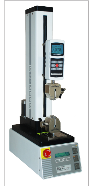
Shown with an ESM301 test stand and G1061 wedge grips

The Series 5's averaging mode addresses the need to record the average force over time, useful in applications such as peel testing, while external trigger mode makes switch activation testing simple and accurate. An ergonomic, reversible aluminum design allows for hand held use or test stand mounting for more sophisticated testing requirements. Series 5 force gauges are directly compatible with Mark-10 test stands, grips, and software.