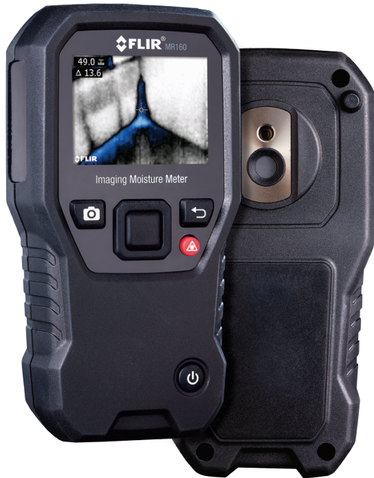
MR160 Imaging Moisture Meter

The FLIR MR160 Imaging Moisture Meter is the first of its kind . Equipped with a built-in thermal camera, MR160 is the only moisture meter with the power to show you where to measure the problem.