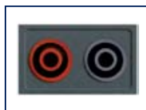
Jacks: Two standard safety banana jacks (4mm)