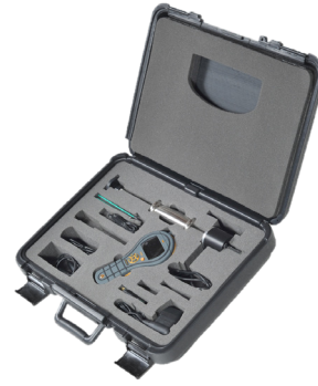
MMS2 Hard Carry Case Kit