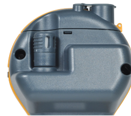
Quikstick ST POL8751, standard with all MMS2 kits and with the same performance as the standard Quikstick. A Quikstick ST can remain connected to the MMS 2 while using the pins.

Readings from multiple Hygrosticks can be taken and recorded with ease. Humidity readings can be taken with the use of humidity sleeves or humidity box. Hygrosticks, not Humisticks, should be used for this test.