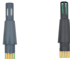
Hygrostick part number POL4750, for high moisture applications.