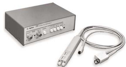
1141A 200 MHz Differential Probe