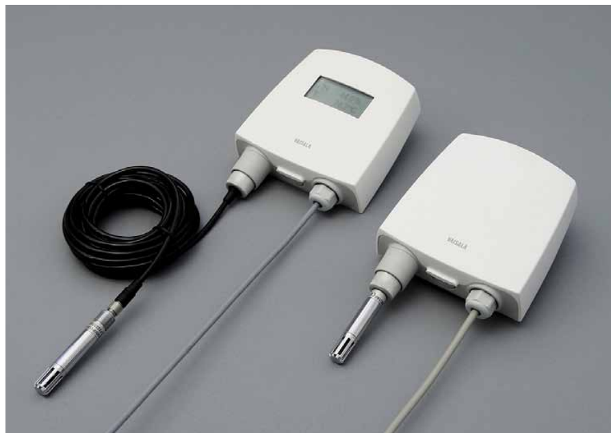
The HMT120/130 with and without a display.

The Vaisala HUMICAP® Humidity and Temperature Transmitters HMT120 and HMT130 are designed for humidity and temperature monitoring in cleanrooms and are also suitable for demanding HVAC and light industrial applications.