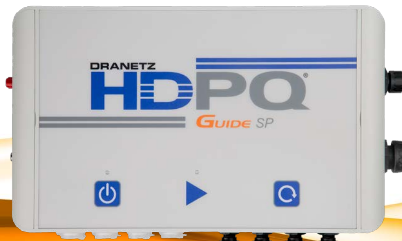
Dranetz HDPQ ® Guide SP IP65 Enclosure - No Display

Ethernet, 802.11 b/g/n Wireless USB On the Go Bluetooth via USB adapter VNC remote control Android ® & Apple ® App