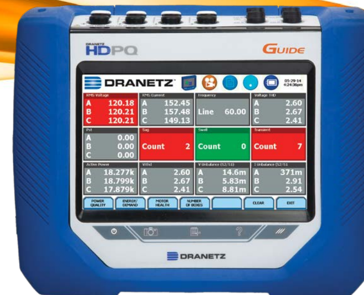
Dranetz HDPQ ® Guide 7" Color, Touch Display

The Best Combination of Value & Technology in a PQ Analyzer – Safe, Powerful & Intelligent!