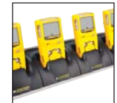
Five unit cradle charger

For a complete list of accessories, please contact BW Technologies by Honeywell.