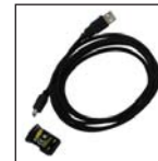
IR connectivity kit