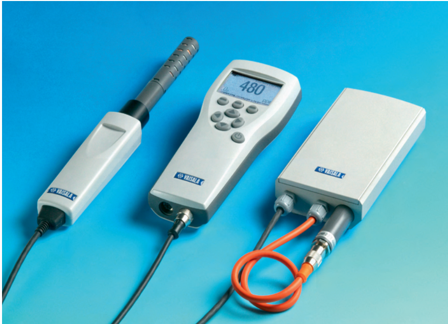
The Vaisala CARBOCAP® Hand-Held Carbon Dioxide Meter GM70 is the demanding professional's choice for hand-held carbon dioxide measurement. The meter consists of the indicator (center) and probe, used either with the handle (left) or pump (right).

The Vaisala CARBOCAP® Hand-Held Carbon Dioxide Meter GM70 is a user-friendly meter for demanding spot measurements in laboratories, greenhouses and mushroom farms. The meter can also be used in HVAC and industrial applications, and as a tool for checking fixed CO 2 instruments.