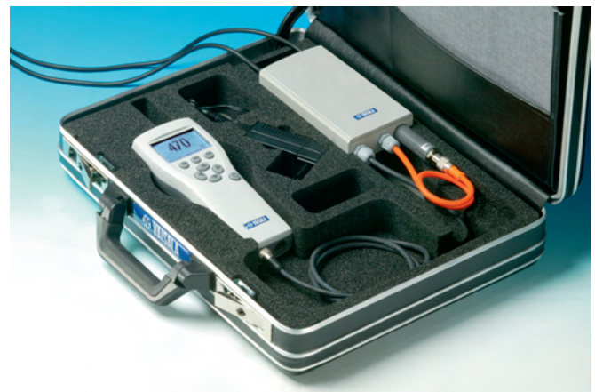
The GM70 in pump-aspirated mode is used for example to check incubators in the field.

CARBOCAP® is a registered trademark of Vaisala. Specifications subject to change without prior notice. ©Vaisala Oyj