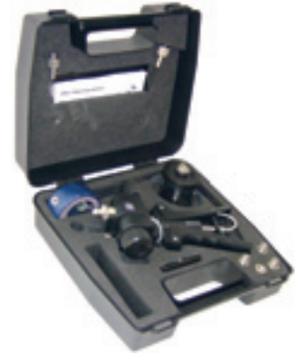
Pneumatic and hydraulic test kit