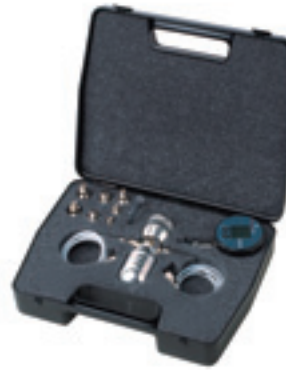
Low pressure pneumatic test kit

Includes: DPI 104; ranges to 10,000 psi (700 bar), PV 411A combined pneumatic and hydraulic test pump, hydraulic reservoir, hose, adaptors, seal kit and case.