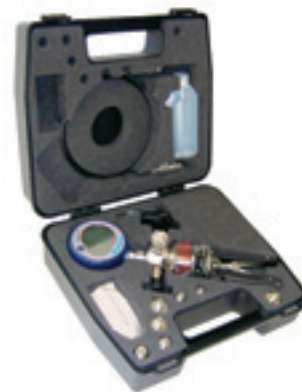
Hydraulic test kit