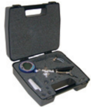
Pneumatic test kit