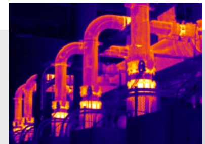
MultiSharp™ Focus, available on the Ti450.