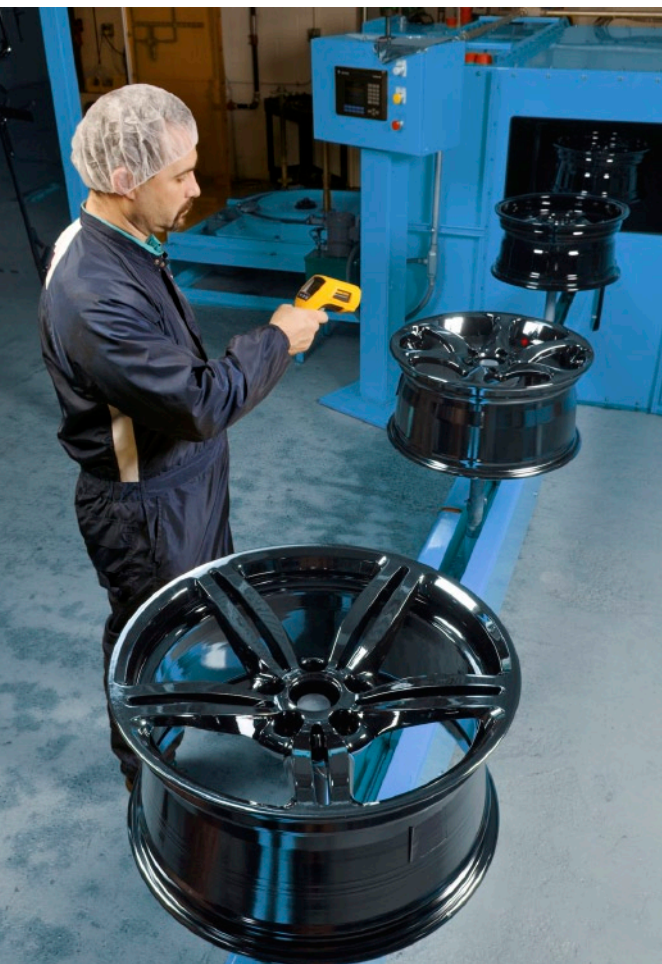
Mitch Curtin of Helios Coatings Inc., uses the 568 IR Thermometer to check the exit temperature of wheels after a metal primer coating is cured in a UV oven.