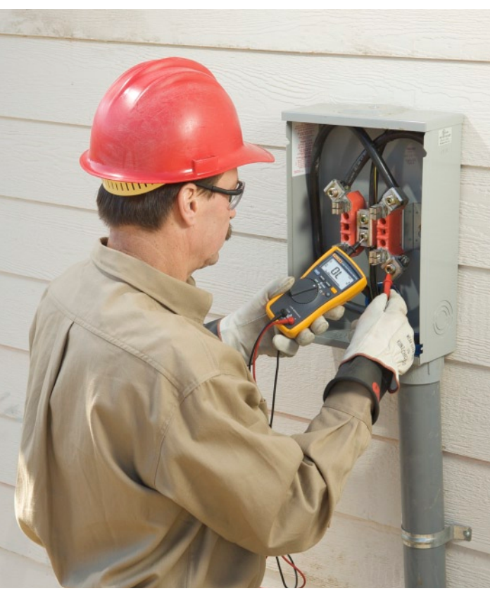
Measuring load side to neutral.

This application note describes the procedure for testing a meter socket with the Fluke 113 Utility Multimeter before setting or re-connecting a revenue meter to utility power.