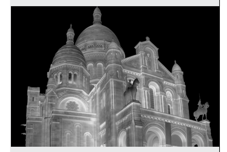
High value buildings