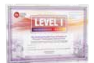
ITC Level I In-person/classroom