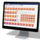
FLIR Thermal Studio Pro 1 year Subscription