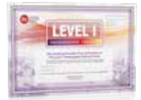
ITC Online Level I Thermography Course