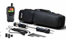
FLIR MR176-KIT5 Professional Imaging Moisture Kit