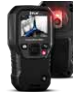
FLIR MR160 FLIR Imaging Moisture Meter