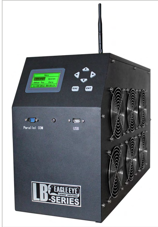
SLB-Series DC Load Bank