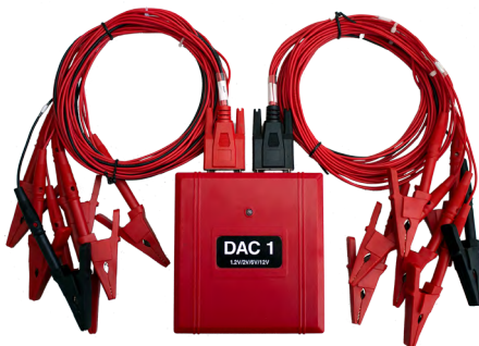
Data Acquisition Case (DAC)

Eagle Eye's SMART Load Banks come standard with monitoring of the system during discharge - as well as four (4) conditions to automatically stop the test. An optional DAC package allows the voltage of EACH CELL to be wirelessly recorded and displayed during discharge. The DAC package allows the user to evaluate the health of each cell and replace only the cells that require replacement - saving time and money by significantly reducing labor hours and replacement costs.