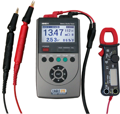
IBEX-Ultra with 4-Pin Test Leads and DC Clamp Meter