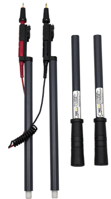
Optional Extender Rods