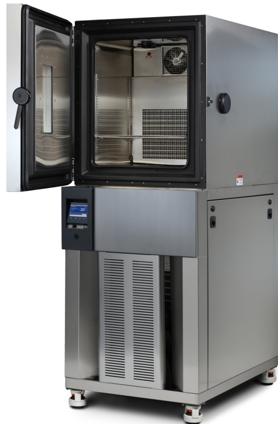
Shown with optional features: window, shelf, cable access port on right (instead of left)