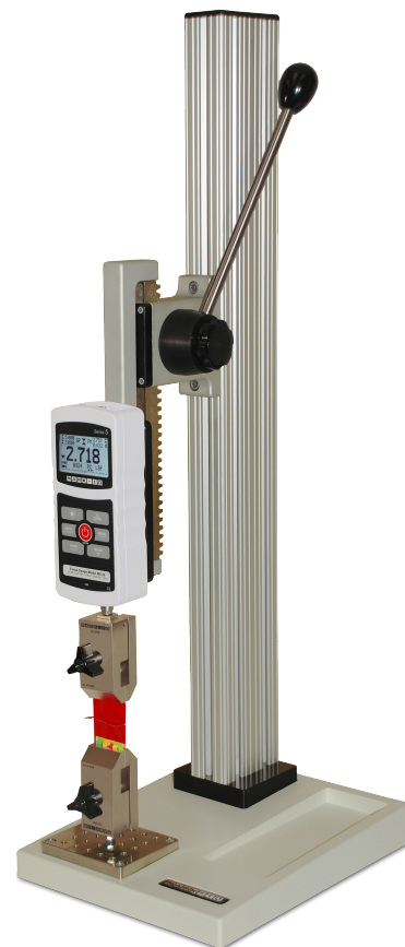
The TSB100 is shown with a Series 5 force gauge