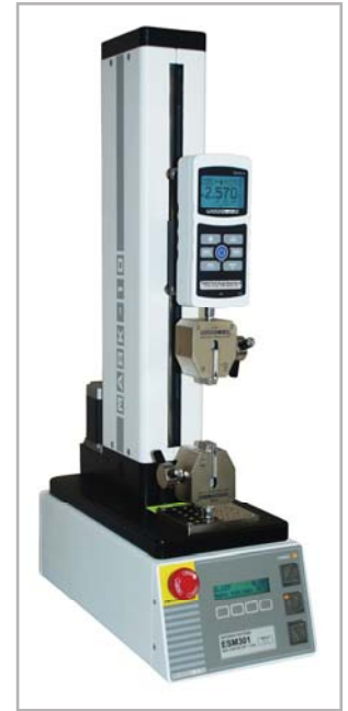
Shown with an ESM301 test stand and G1061 wedge grips

On-board data memory for up to 50 readings is included, as are statistical calculations with output to a PC. Integrated set points with indicators and outputs are ideal for pass-fail testing and for triggering external devices such as an alarm, relay, or test stand. The gauges are overload protected to 150% of capacity, and an analog load bar is shown on the display for graphical representation of applied force.